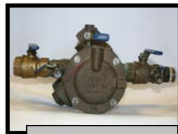
RPZ backflow prevention device.

To protect the Village of Norridge's drinking water supply from backflow - related health hazards, backflow prevention devices