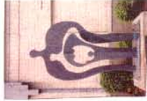
COMPASSION CARE HOPE